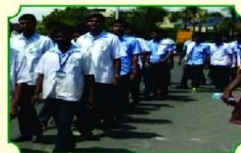
International Yoga day rally at Perundurai on 21 st June 2017