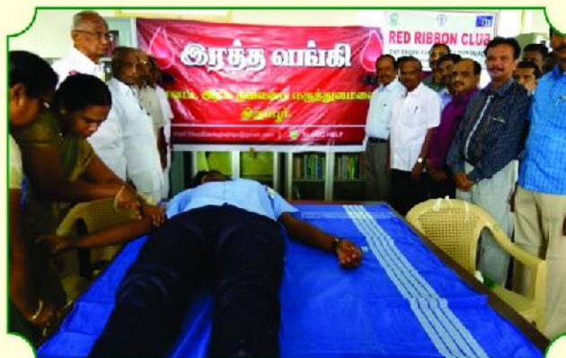
Blood Donation Camp organised by RRC on 9 th January 2017