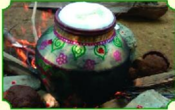
Pongal Celebration January 2017