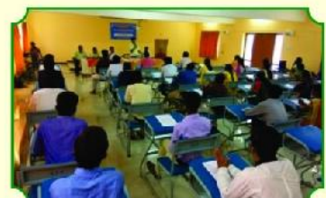
Campus Interview by Thulasi Pharmacies India PVT LTD on 25 th April 2017