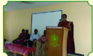
Women's Day Celebration in Our Campus on 8 th March 2017