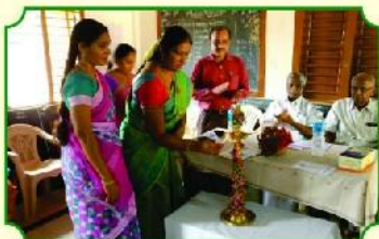
NSS Special Camp Inaugural at Muthampalayam Municipality Elementary School 20 th March 2017