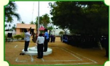
68 th Republic Day Celebration at our campus on 26 th January 2017